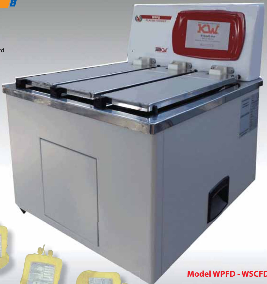
Model WPFD - WSCFD