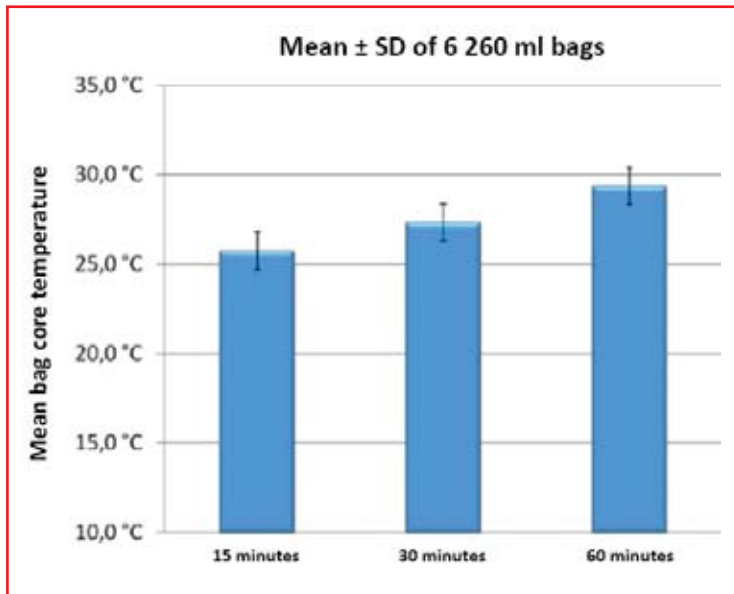
Figure 3: Even in case of negligence on the part of the operator, the mean temperature of the thawed bags does not reach potentially dangerous levels

Worst-case simulation: after a normal 15 minute thawing cycle, the 260 ml bag was left inside the thawer and bag core T was measured after 30 and 60 minutes. We assessed that bag core T increases by an average of approx. 2°C every 30 minutes, but does not reach potentially dangerous levels for product integrity even after 60 minutes.