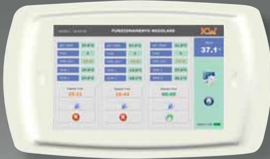
"TOUCH SCREEN" DISPLAY