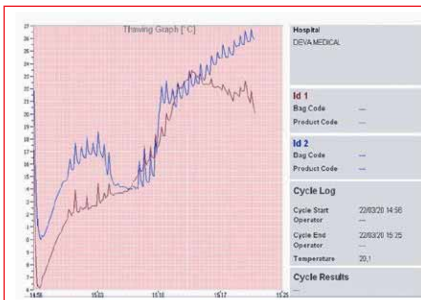
Figure 2: To thaw one or more 600 ml bags, cycle time can be set between 25 and 27 minutes, with tray temperature of 40°C

In this step, we performed a total of 9 tests, detecting a mean bag core temperature of 26°C and assessing that the minimum cycle duration is equal to 15 minutes.