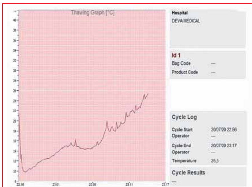
Figure 1: To thaw one 260 ml bag, cycle time can be set between 15 and 18 minutes with tray temperature of 40°C

Or the appliance can be included in the user LAN via Ethernet port (also Wi-Fi)