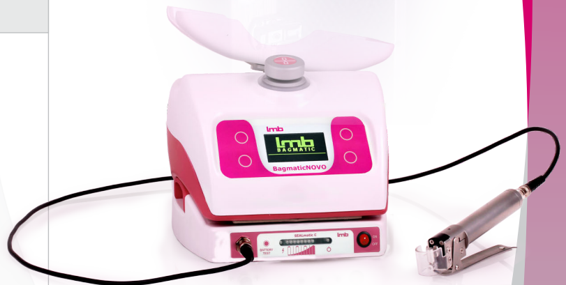
Bagmatic NOVO with SEALmatic C