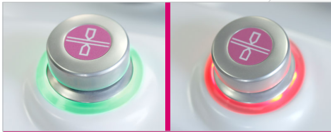
Illumination ring for visual control of the process